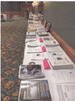
Cruise books, newsletter articles; PROVIDENCE history books for CL-82 and CLG-6; ship and military awards; many personal and official photos; original building plans for CL-82; and personal memorabilia donated by shipmates. Far too much to mention in this