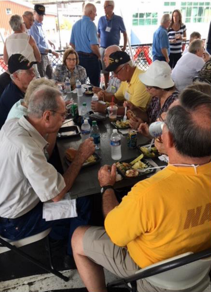
Beef on Weck, on the fantail