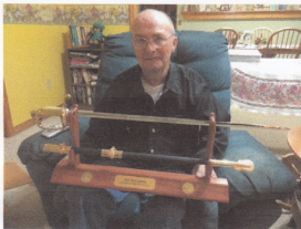
Ceremonial sword with display