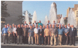
THE CLG CREW