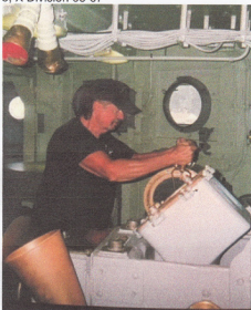
The author on the lee helm trying to get flank Speed from the LITTLE ROCK.