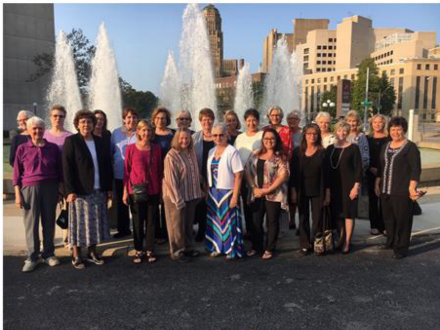
Ladies of the PROVIDENCE