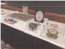
Front: 1959 CLG-6 Commissioning pennant, silver gun cover (tompson) and brass clock from Chief's Mess. Left rear – Navy Unit Commendation Flag for CLG-6 and two silver napkin rings from the Admiral's Quarters.