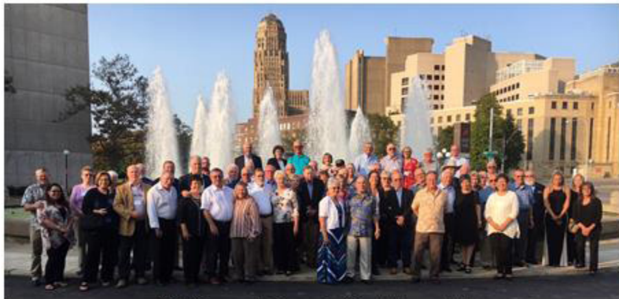
CLG-6 crew and wives or significant other or relative