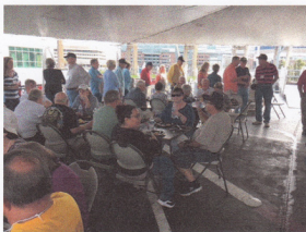
Fantail lunch of a Buffalo "Beef on Weck"