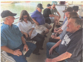
Cruisin on the Buffalo River and Harbor.