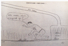
Suspicious confirmed Eggs on the fireroom deck.

In my job aboard PROVIDENCE in PAO I was responsible for the "PROVIDENCE Journal", liberty port brochures, press releases and newsletters. (also the "suspicious confirmed" cartoons that the XO hated). I had access to pictures of our ship that mostly were destined to Officers' requests. Admittedly, I also used them for "cumshaw" purposes. Color photos for larger favors and B&W for smaller ones.